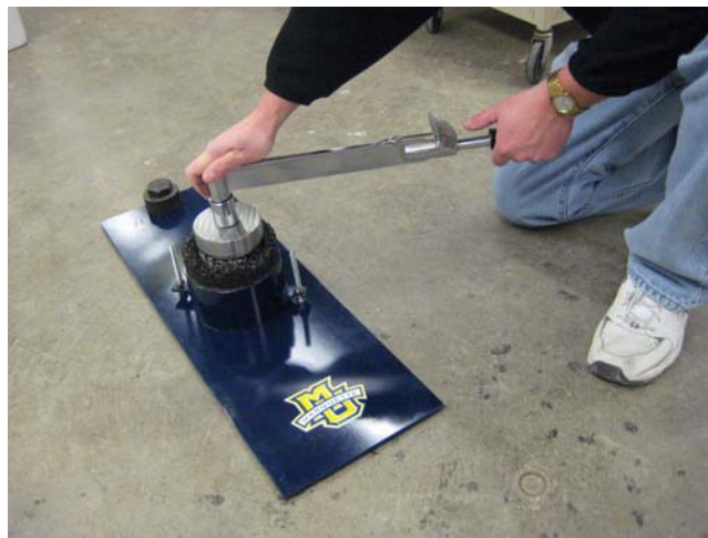
Figure 4: Specimen Set-up for Torque Test