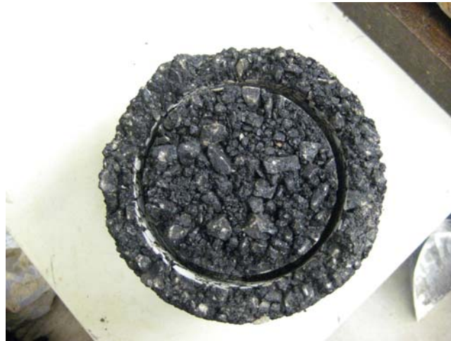
Figure 3: Prepared Specimen with 4-inch Core Cut Through Overlay