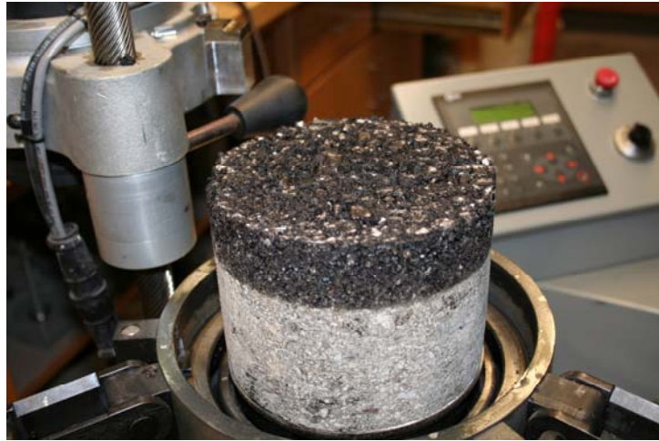
Figure 2: Compacted Gyratory Specimen with 1.5" Overlay and 3" Base Layer